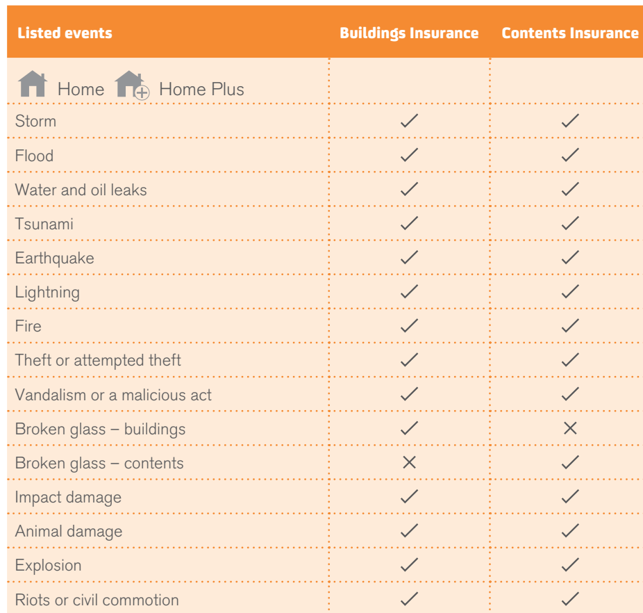
Table 3.1 – Listed events