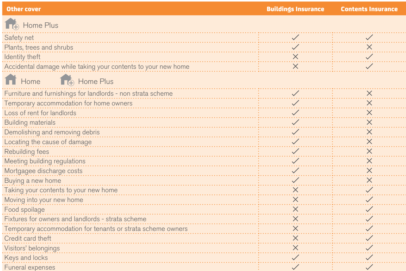
Table 3.2 – Other cover