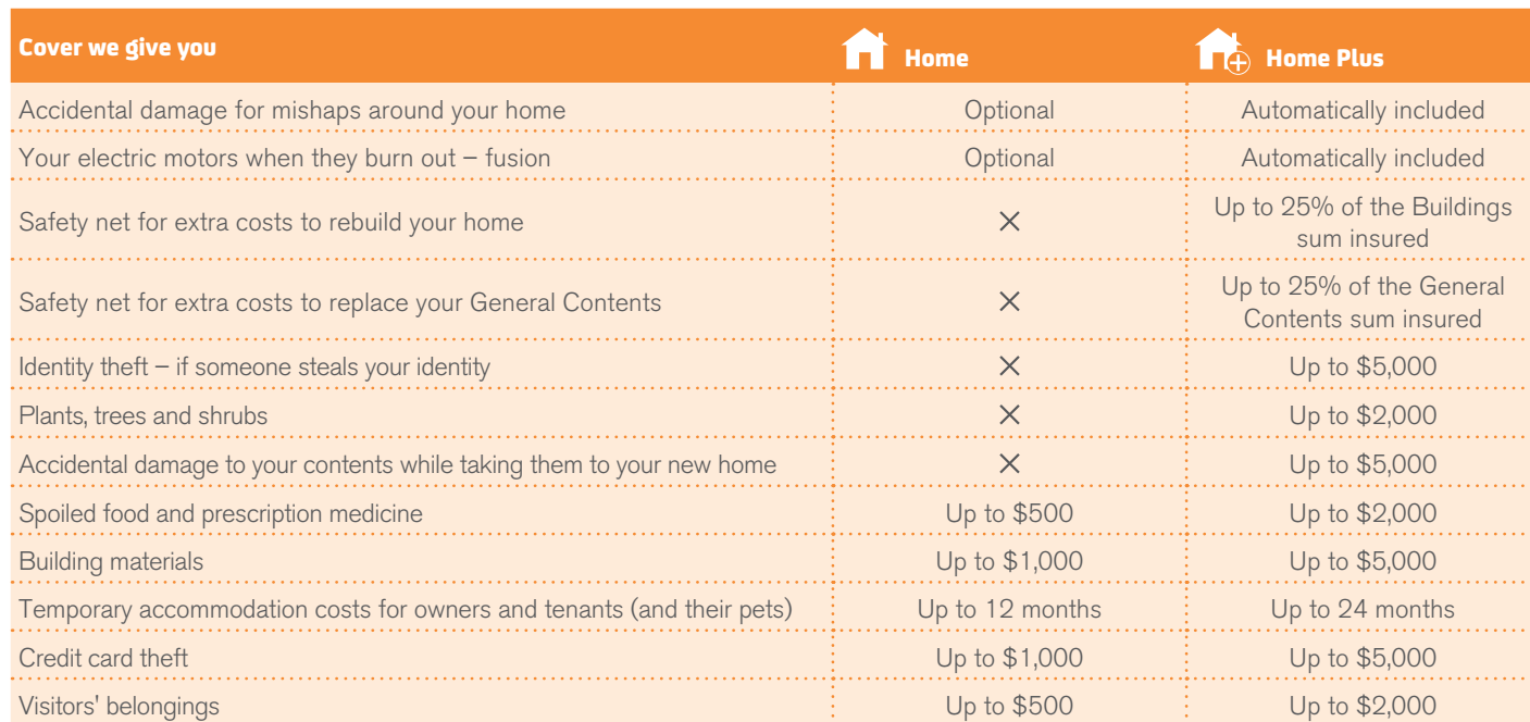
Table 1.1 – Differences between a Home policy and a Home Plus policy