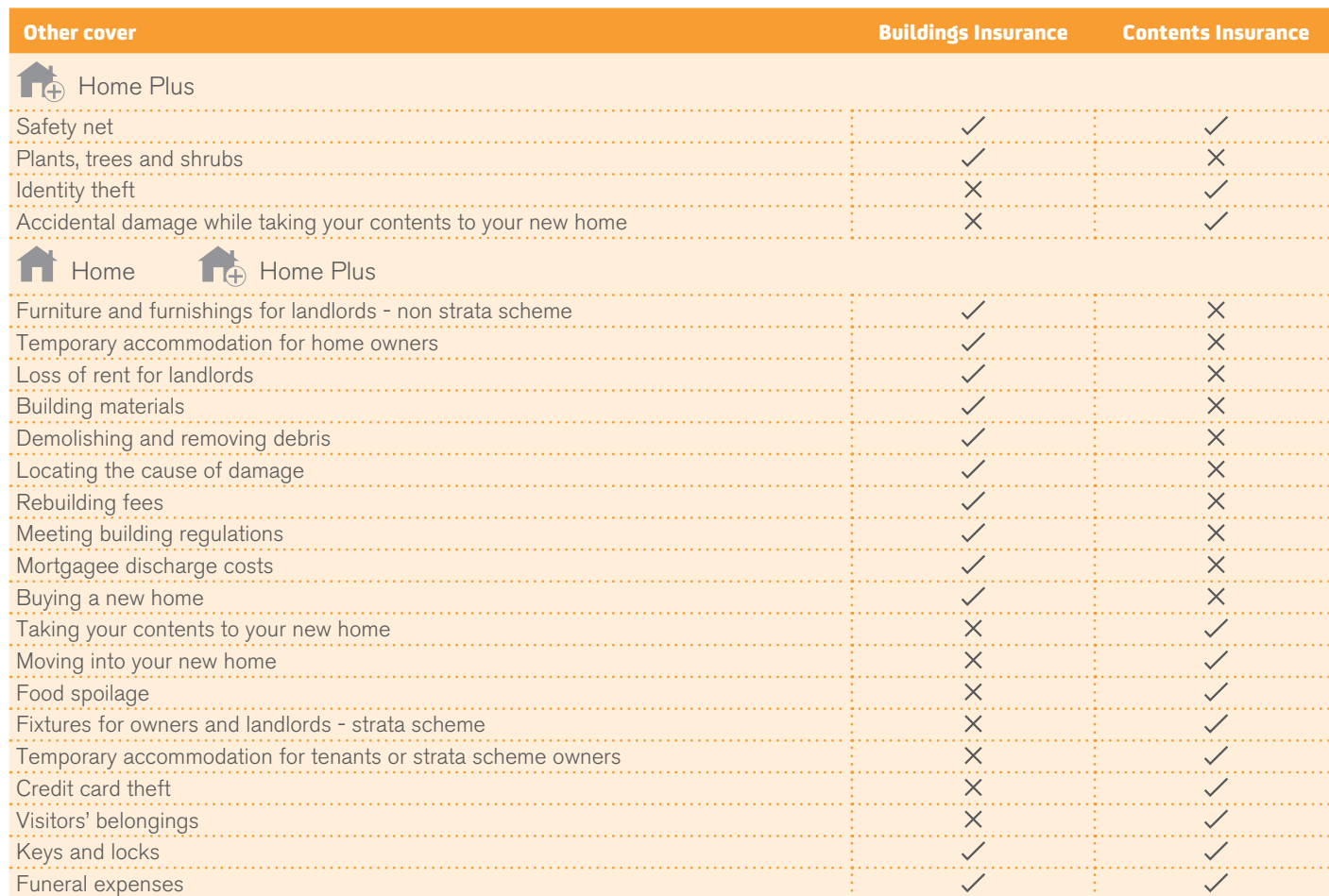
Table 3.2 – Other cover